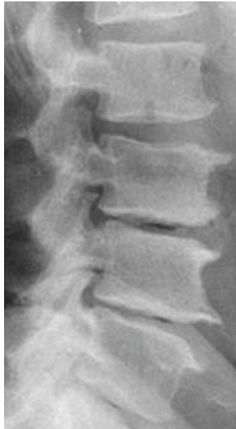
Fig. 1. An x-ray of the lateral lumbar spine with intervertebral disc narrowing and anterior osteophytes at L3-L4 and L4-L5 spinal levels.