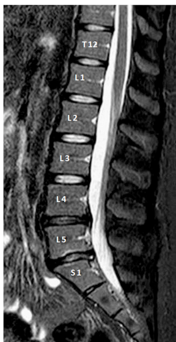
Fig. 4. A midsagittal T2-weighted MRI illustrating early imaging signs of disc degeneration (reduced brightness of T2-signal sometimes called a “dark disc” and the presence of disc bulging) at L4-5 and L5-S1.

normal aging disc from a pathologically degenerated one. In addition to the imaging studies, information gained from microscopic, histological, or biochemical analysis, as well as surgical and autopsy samples can provide a macroscopic measurement of disc degeneration (9).