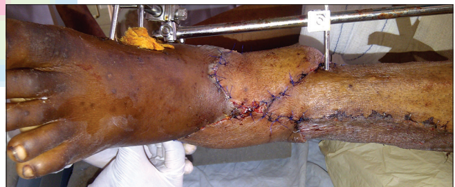
Figure 2: Immediate postoperative picture