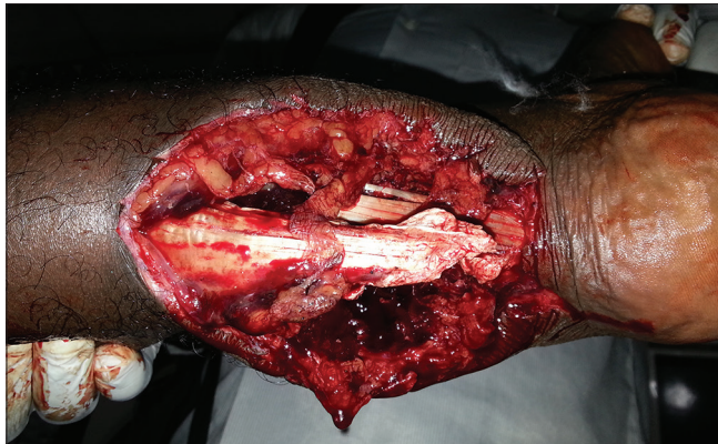
Figure 4: Preoperative picture showing exposed Achilles tendon. The cavitation effect of the gunshot damaged the sural artery

Perforators in the proposed donor tissue close to the defect were located preoperatively using handheld Doppler (probe) and marked on the skin using methylene blue [Figure 7]. The flaps were then designed like blades of a propeller adjacent to the defects. The proximal end of the flap to the targeted perforator is made equidistant from the distal end of the defect to the perforator.