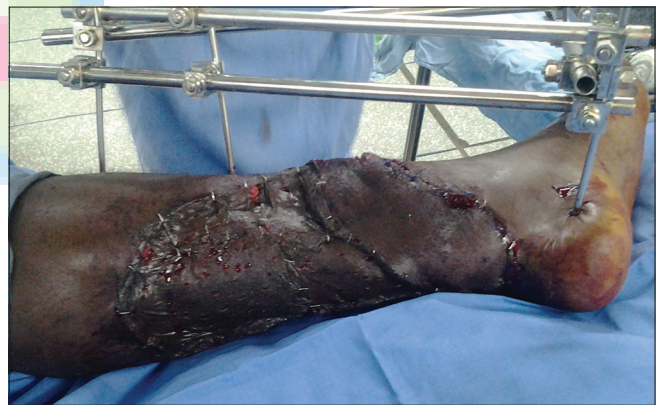
Figure 5: Immediate postoperative picture

The sizes of the secondary defects were reduced by suturing and the remaining defect skin grafted. Primary closure was not possible in all the donor sites due to the size of flaps harvested. Bedside, flap monitoring was achieved via a window created within the dressing to examine the flaps.