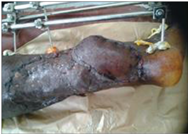
Figure 6: Fifth postoperative day

The flap sizes were made to be 0.5 cm more than the size of the defect to be covered to aid closure without tension.