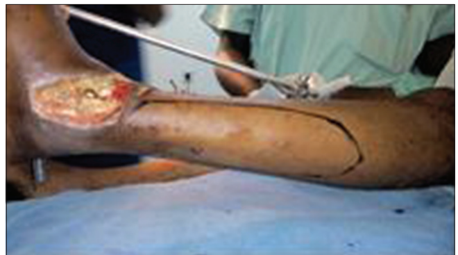
Figure 7: Preoperative planning showing the flap outline. Identified perforators were marked as x on the outline