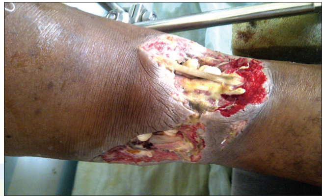
Figure 1: Preoperative picture before debridement

The second patient was shot during an argument; he sustained Gustilo 3B open fractures. The entry wound was quite small, but the exit wound located posteriorly measured 14 cm × 11 cm and a large portion of the Achilles tendon was exposed. The sural artery was found severed in the wound