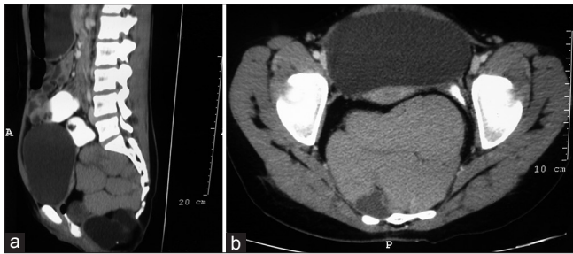
Figure 1 (a and b): CECT abdomen showing multiseptated pre sacral mass compressing the rectum and displacing bladder superiorly

The retrorectal space is a potential space developed when a mass displaces the rectum anteriorly. It is formed posteriorly by the sacrum and coccyx and anteriorly by the