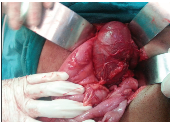
Figure 2: Intraoperative picture showing a tubular fluid-filled structure displacing the bowel loops