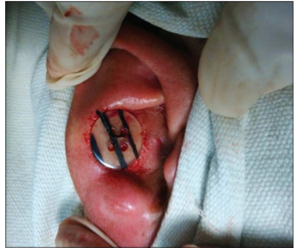
Figure 2: Buttons tied to pseudocyst