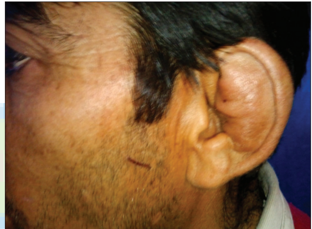
Figure 4: Pseudocyst involving antihelix, triangular fossa, and scaphoid fossa