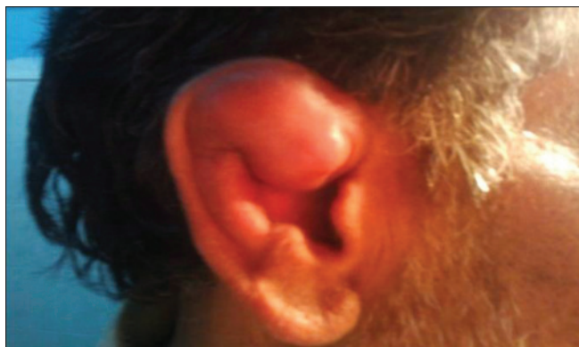
Figure 5: Pseudocyst predominantly involving triangular fossa

success rate was 96% in primary cases. One patient that failed primary I and D and buttoning underwent incision and drainage with removal of anterior cartilage leaflet and buttoning as a secondary procedure after a month's gap and there was no recurrence after this procedure [Table 6].