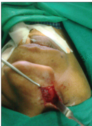
Figure 2: Lateral rhinotomy incision