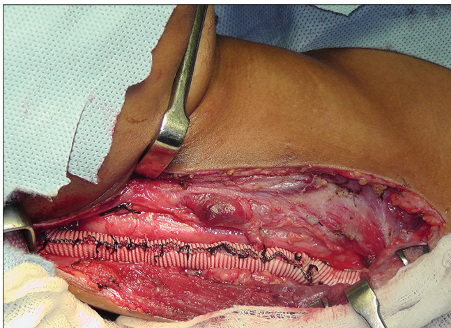
Figure 3: Right internal jugular vein wrapped in an 8-mm PTFE tube graft

Care was taken to prevent inadvertent damage to the jugular vein or the contents of the carotid sheath. This reinforcement prevented the vein from dilating and at the same time preserved its function.