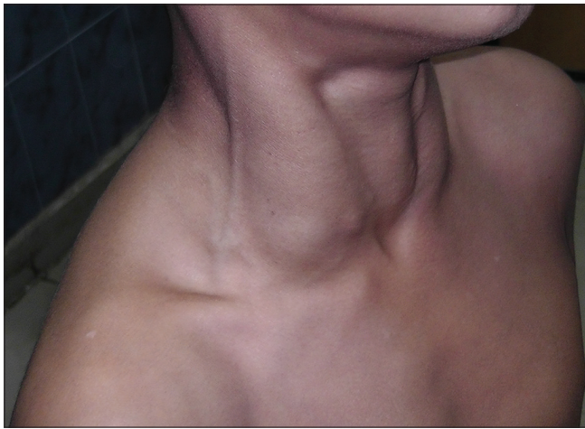
Figure 1: During Valsalva maneuver, apparent swelling seen on the right side of the neck