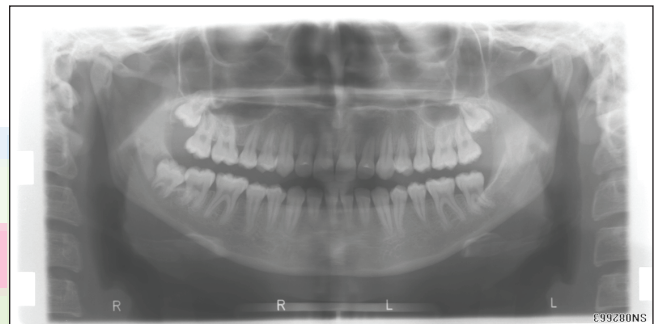
Figure 5: Posttreatment radiographic records of the case

At the end of the 2 years retention period, Class I molar and canine relationships were established with satisfactory interdigitation of the posterior teeth [Figure 6]. Acceptable overjet and overbite were also achieved. The superimpositions of the patient's cephalometric films were done [Figure 7].