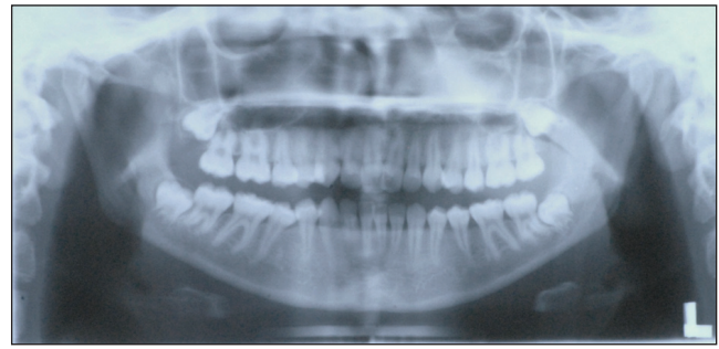
Figure 2: Pretreatment radiographic records of the case

The patient and her parents requested full alignment of the upper anterior teeth, without extractions. There were two choices to achieve this movement: Intraoral distalization mechanics and headgear. The patient refused to wear headgear because of social and esthetic concerns.