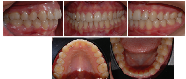
Figure 4: Posttreatment intraoral photographs of the case