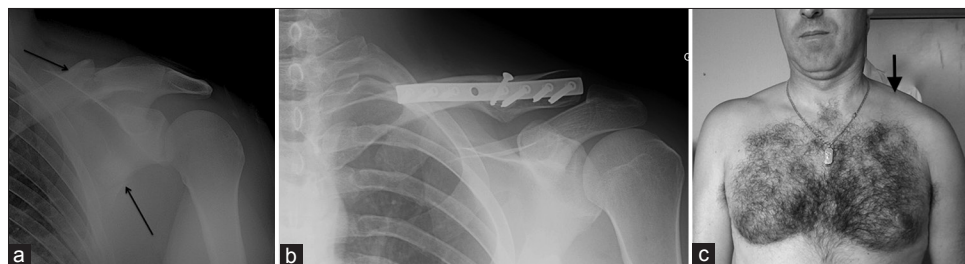
Figure 2: (a) Floating shoulder with midshaft clavicular fracture and surgical scapular neck fracture (black arrows). (b) Open reduction and internal fixation of the clavicle with fracture healing. (c) Clinical presentation with a slight persistent drooping shoulder at 61 months of follow-up (white arrow)

In another way we did not find statistical differences in clinical outcomes between operative and conservative group and we