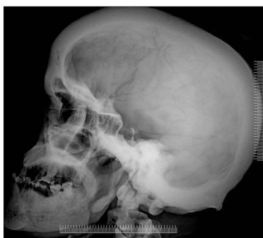
Figure 3: Sclerosed skull bones