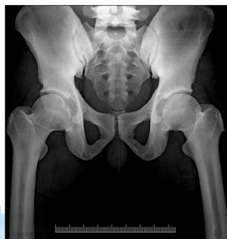
Figure 4: Dense pelvic bones and femorii

Most of the reported patients of sclerosteosis are from the Afrikanar population [5] (descendants of the Dutch settlers) of South Africa. To our knowledge, this is the first such report from India.