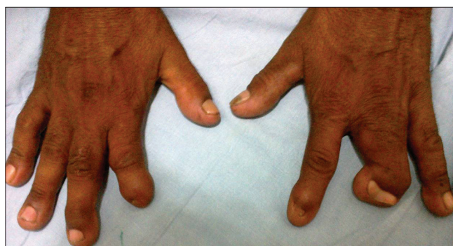
Figure 2: Syndactyly and hypoplastic nails