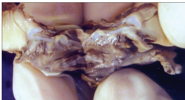
Figure 1: Gross bisected specimen of the larynx showing atresia of lumen with normal cartilages