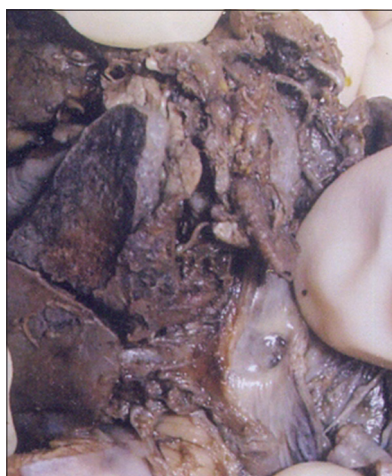
Figure 3: The esophageal lumen showing opening of one of the bronchus