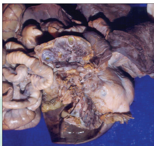
Figure 4: Gross specimen showing cystic changes of both kidneys