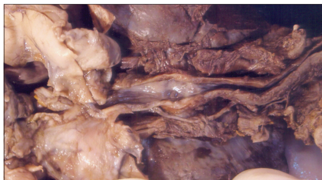
Figure 2: En block gross specimen showing the lumen of the esophagus with depressions of the bronchial openings